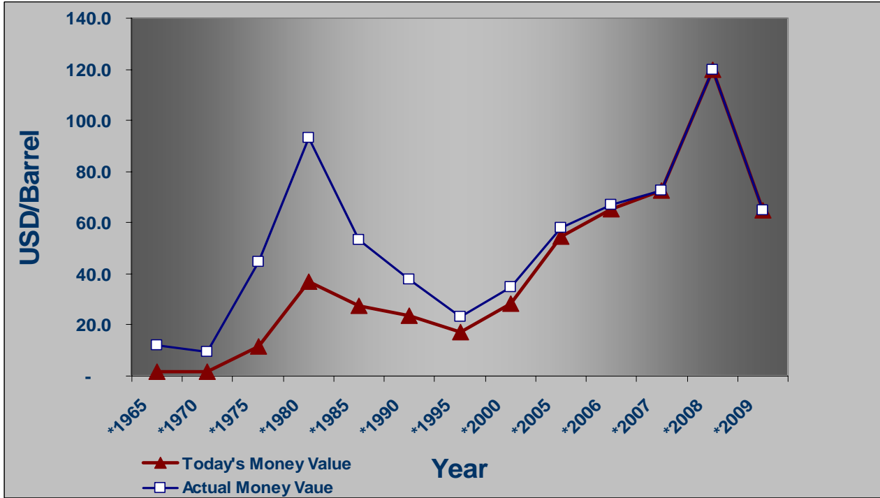
Crude Oil (1965 – 2009)